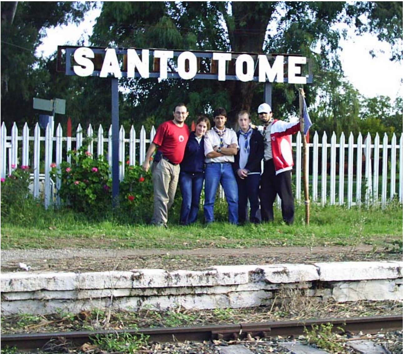
Open Forum's Closure Report: Youth Participation & Millennium Development Goals Santo Tome City, Santa Fe, Argentina. April 2nd. 2005.