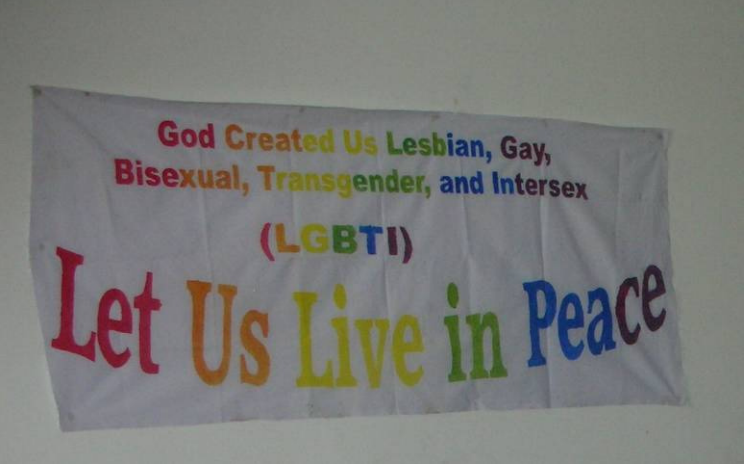
Banner at the launch of the first Ugandan LGBT Human Rights Media Campaign, "LET US LIVE IN PEACE" on 16 August 2007.

"However long we waited, it has come to pass and justice has prevailed."