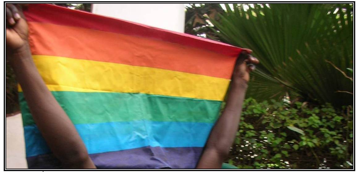
After the 3<sup>rd</sup> scheduled hearing on 11 June 2007, Kuchus took turns proudly holding the rainbow flags to shouts of "Viva kuchus of Uganda". From the end of the long line of tables, two of the first known homemade Ugandan rainbow flags were unfurled.