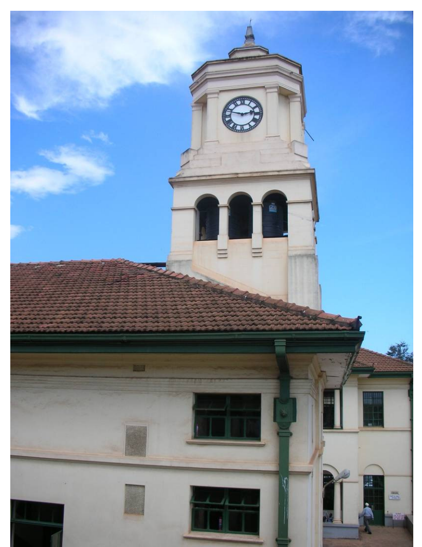
The High Court of Uganda