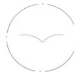
Su 3/8 76. WISDOM

Rejoice. The new life starts blossoming.