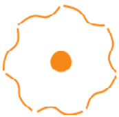
We 3/4 72. BLACK HOLE

The dance of the universe expresses itself naturally through you.