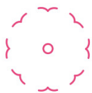
Th 3/5 73. CELEBRATION

In the center of the universe is pure BEING. Perceive the waves of resonance, wonder and tune yourself into this rhythm.