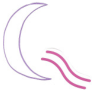
Th 2/26 66. LETTING GO

Let go of all your judgements how you think life should be.